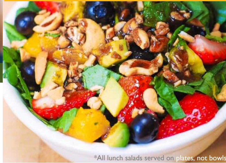
*All lunch salads served on plates, not bowls